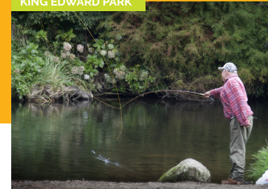
KING EDWARD PARK

Located within easy reach of the town centre King Edward Park is an ideal sanctuary to experience countless varieties of plants, mature trees and birdlife and fast-flowing mountain streams.