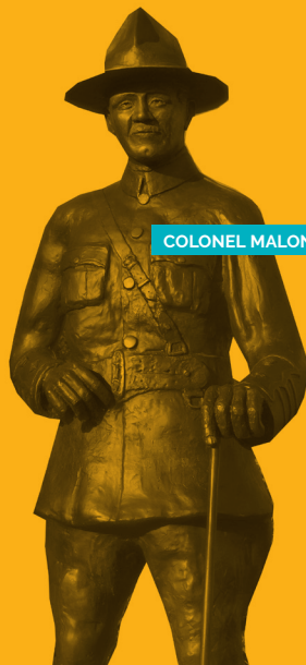
COLONEL MALONE STATUE

There is a lot to see and do, so get going!