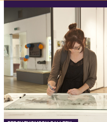
PERCY THOMSON GALLERY

Late Stratford businessman and former mayor Percy Thomson, by his will, left the district a significant bequest towards the establishment and maintenance of an arboretum and herbarium of the native flora of New Zealand, and an art gallery. Located in Prospero Place, the art gallery has received national recognition as a thriving and diverse exhibition space catering for all age groups and interests involving the community at large.