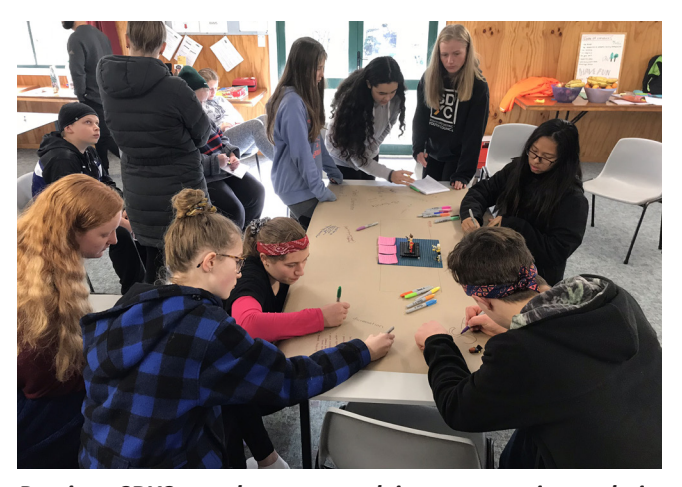
Previous SDYC members get stuck into an exercise at their training camp held in Te Wera.

Activities outside of these meetings provide further opportunities to make the most out of the experience.