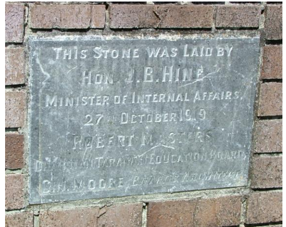
Inscription reads: This stone was laid by Hon. J.B. Hine, Minister of Internal Affairs, 27 October 1919

In June 1921 Mr. Tyrer reported to the School Committee that the full list of equipment needed would probably cost £4,000, the science lab would cost £1,000, and a path from the street to the main entrance was a necessity. He felt that it was very unlikely the Education Department would give a grant for these costs, and said that actions should be taken to raise this money. However, the committee discarded this advice and decided to do nothing, as they felt that the new Board of Governors would have ample time to deal with such things. This faith was misplaced, the formation of the grounds fell short of what was required, and not surprisingly, Mr. Tyrer resigned.