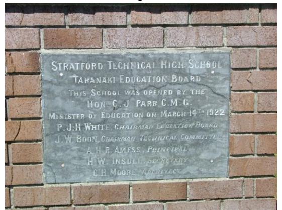
Inscription reads: Stratford Technical High School, Taranaki Education Board, This school was opened by the Hon. C.J. Parr Minister of Education on March 14 th 1922.