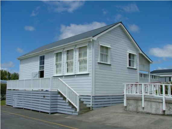
Finnerty Road School (Located at Ngaere Primary)