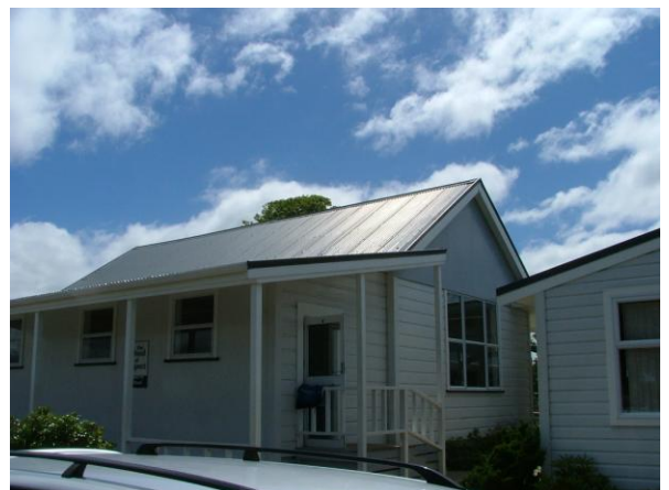
Bird Rd School (Located at Ngaere Primary)