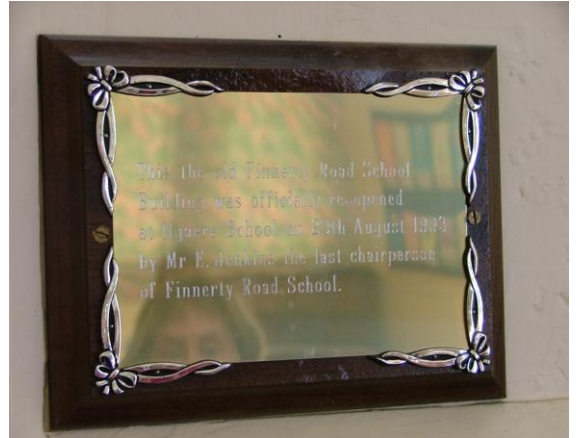
Plaque which reads "This, the old Finnerty Road School Building was officially re-opened at Ngaere School on 20 August 1993 by Mr. E Jenkins, the last chairperson of Finnerty Road School."

In 1993, Finnerty Road School closed down, and as a result the school building was moved to the Ngaere School grounds, to extend the room available for the increasing numbers of students. This also happened with Bird Road School, which closed 18 July 1997. (See photo on previous page )