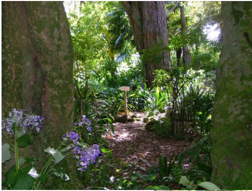
Right: the front lake. Above: a small section of the garden (now cleared)