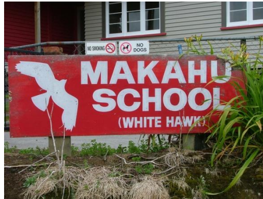
Makahu School sign (Makahu means 'white hawk')

The school at this stage was prospering, with the roll remaining in the 30's. In May 1971, the junior room was extended by 108 square feet, and a work bay, storage shelves and an additional exit were built. The two rooms were also supplied with blackout curtains and vinyl. By 1980, however, the school roll had dropped down to 25, and so the school went back to having only one teacher.