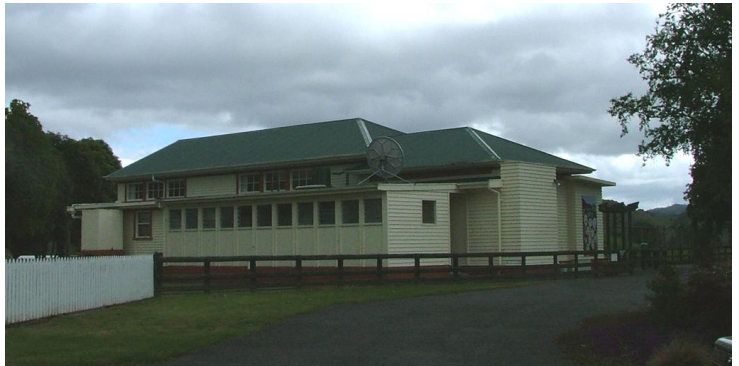
The new Huiakama School