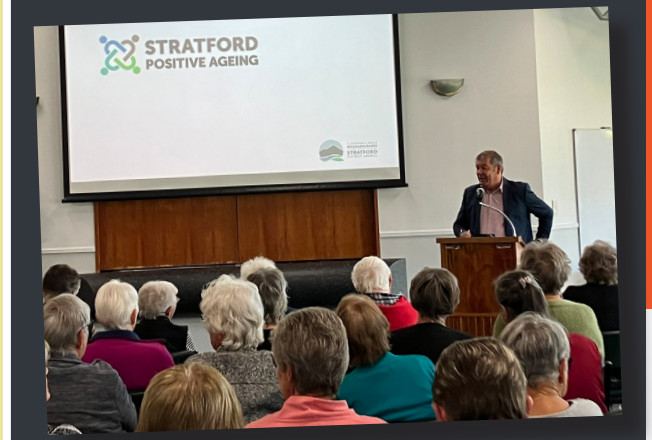
Thanks to everyone who came to our Positive Ageing March Forum!

Go in the draw to WIN 1 of 3 $100 Easter hampers!