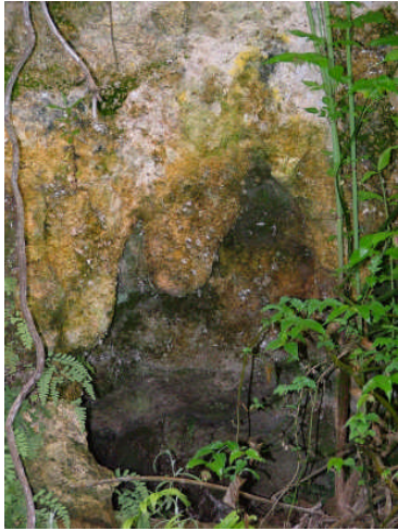
An example of limestone

From the early 1900s, limestone deposits from a quarry on Waiwiri Road were exploited. The stone was originally quarried and burnt in a kiln. However, in 1915 the stone was sent to the recently formed the Toko Lime Company, which was an offshoot of the Hanganiki Lime Company at Waitomo, and was established to simply crush the limestone.