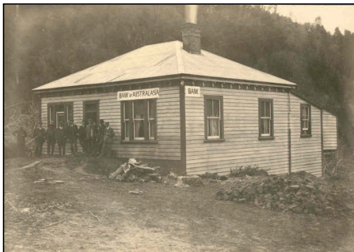
Bank of Australasia, 1912

The building became the District Nurse's residence until the 1960s, when it was handed over to the Council workers for use as their quarters. After that, it was sold into private ownership. Lately, it had also been used as a café, and is one of the most-well kept historic buildings in Whangamomona.